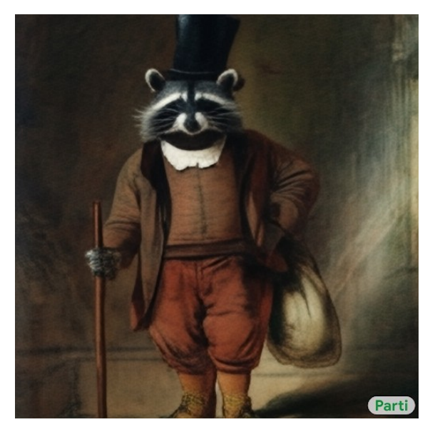
(a) "A raccoon wearing formal clothes, wearing a top hat and holding a cane. The raccoon is holding a garbage bag. Oil painting in the style of Rembrandt"