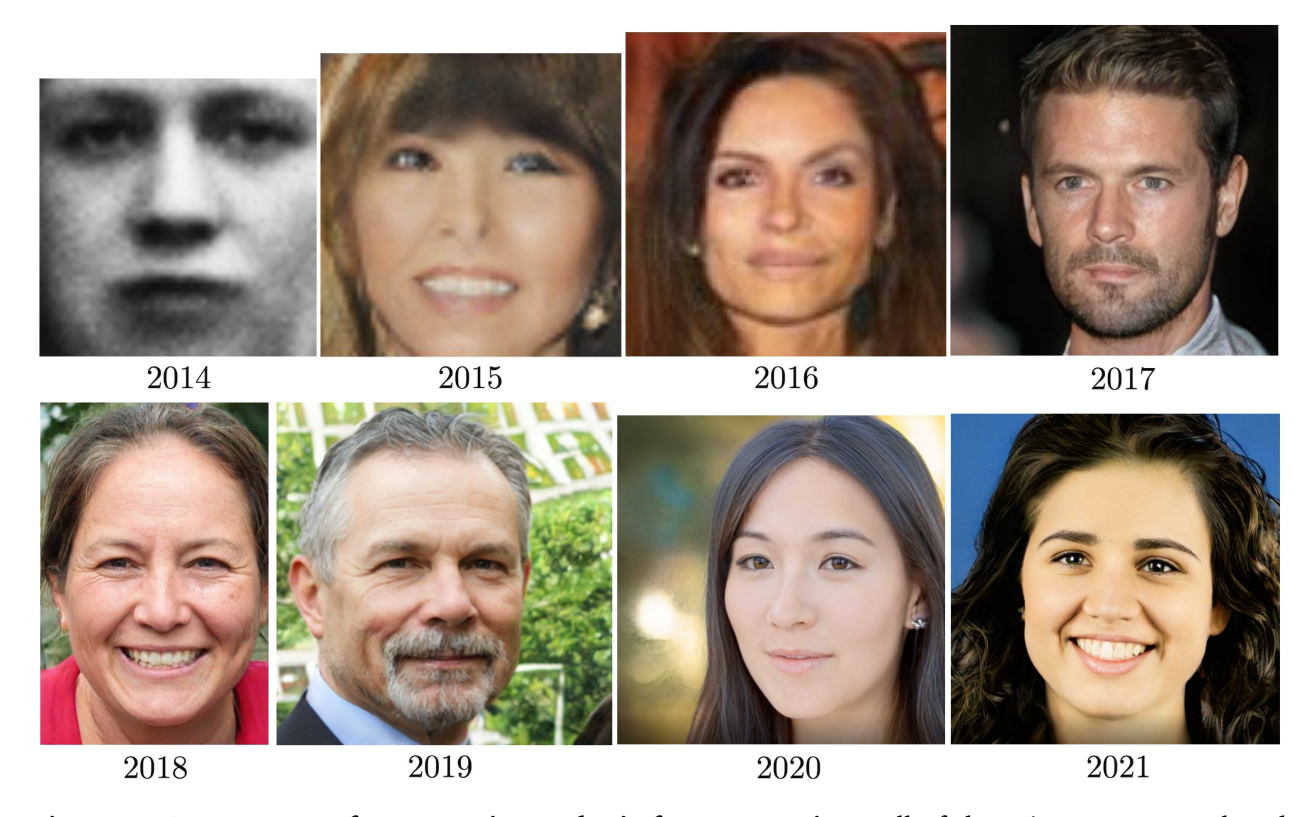
Figure 1: Seven years of progress in synthetic face generation. All of these images are produced with Generative Adversarial Networks. <sup>51</sup>