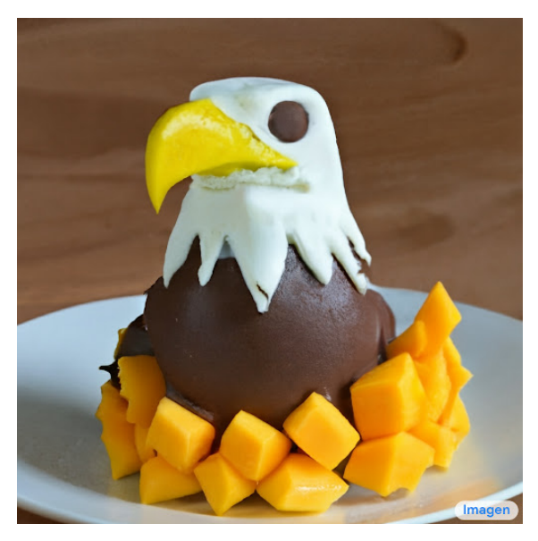
(b) "A bald eagle made of chocolate powder, mango, and whipped cream"