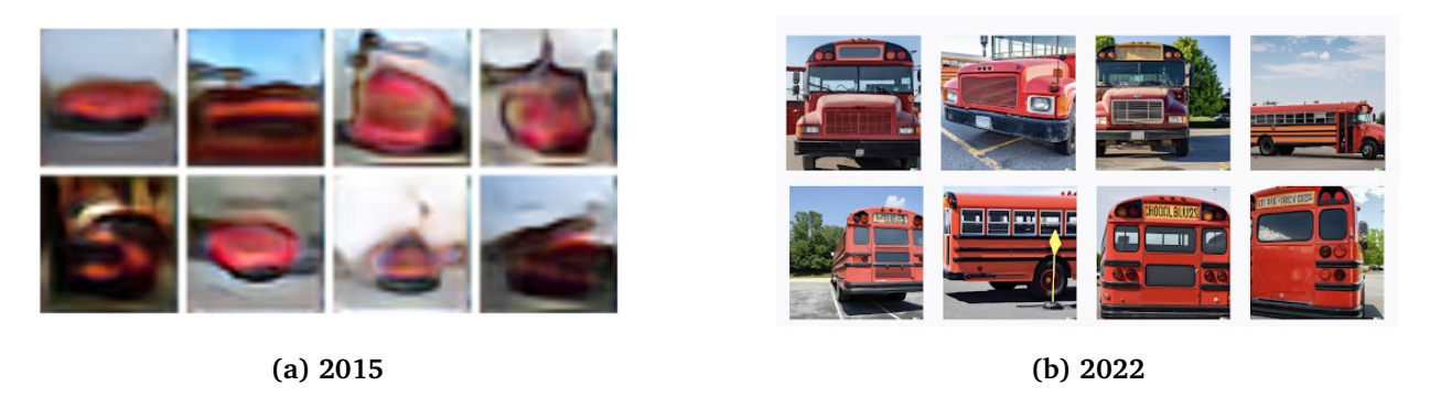
Figure 2: Seven years of progress in image generation from language. Left image from a 2015 paper, which introduced one of the first methods to generate images from text. The prompt is taken from that paper and intends to show novel scenes. On the right, the same prompt is run on OpenAI's DALL•E 2. Today's systems can easily do certain tasks that were hard in 2015.<sup>52</sup>