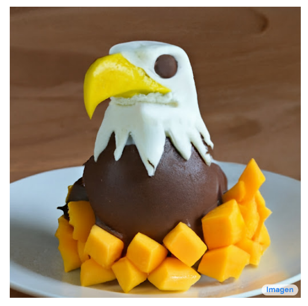
(b) 'A bald eagle made of chocolate powder, mango, and whipped cream"

Figure 3: Elaborate scene construction and composition with 2022 text-to-image models. While Figure 2 shows that 2022 models can do hard tasks from 2015 easily, text-to-image models can also do tasks that were not possible before. In this image, many details of the scene are described via language, and the system translates that into a plausible image. Left is from Google's Parti, and right is from Google's Imagen.<sup>53</sup>