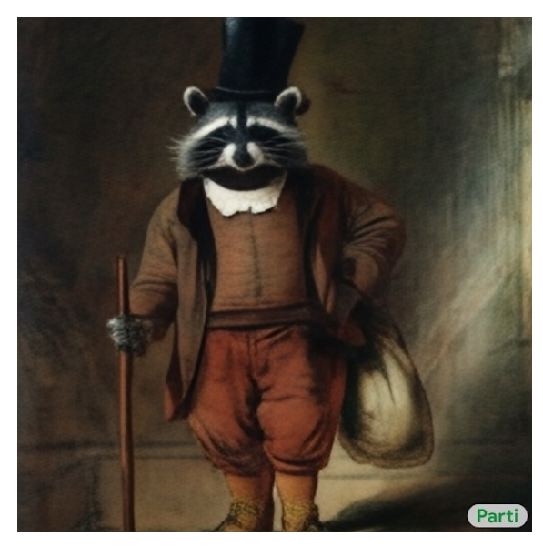
(a) "A raccoon wearing formal clothes, wearing a top hat and holding a cane. The raccoon is holding a garbage bag. Oil painting in the style of Rembrandt"