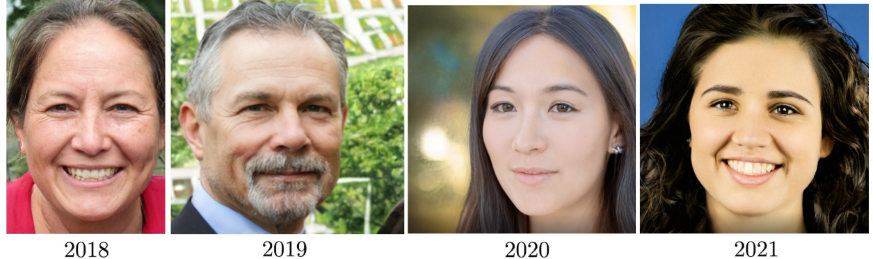
Figure 1: Seven years of progress in synthetic face generation. All of these images are produced with Generative Adversarial Networks.<sup>51</sup>